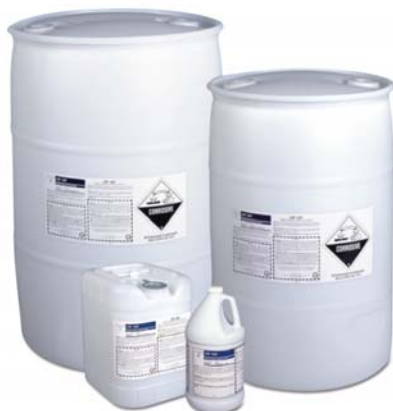
Cage-Klenz 100 Alkaline Detergent

STERIS Life Sciences understands that the integrity of science is absolutely critical in your business. By protecting your animal population (vivarium) from cross-contamination, we also protect your time and cost-intensive research efforts. From organic residues to difficult urine scales, our specially formulated Cage-Klenz® line of research detergents meet your unique cleaning demands to remove the toughest soils.