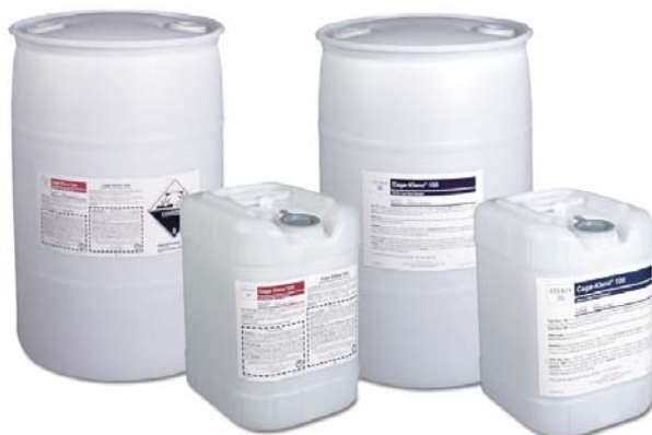
Cage-Klenz 150 Alkaline Detergent