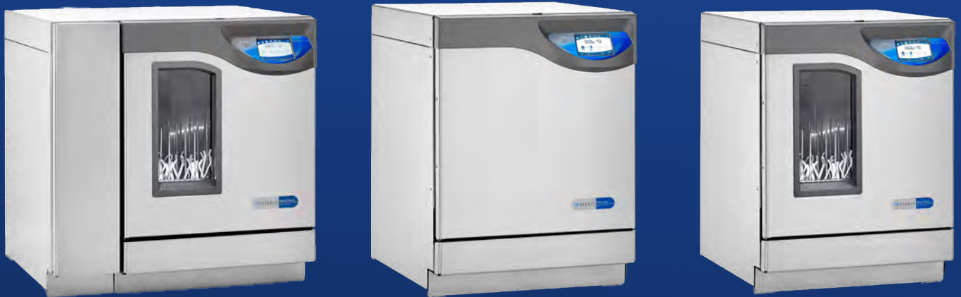
Reliance™ 100 Series Laboratory Glassware Washers