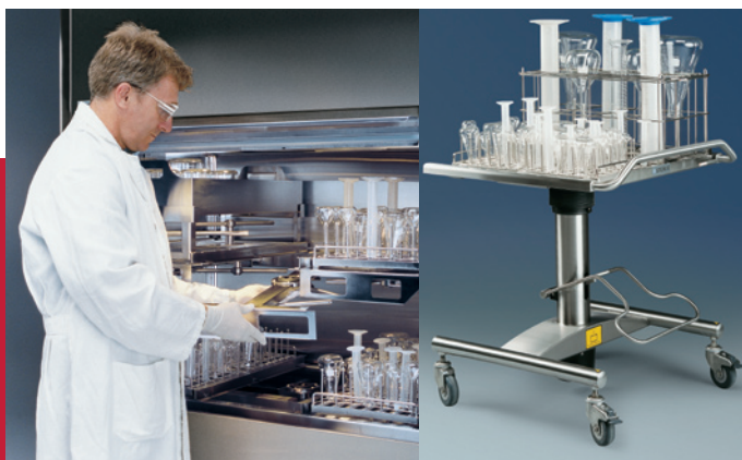
Lightweight sections of the Universal Shelving System can be easily removed to accommodate processing of various sized items.