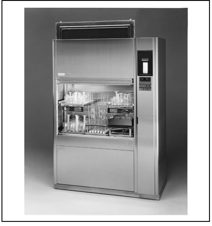
(Typical only - some details may vary.)

Conformity to other applicable directives: Electromagnetic Compatibility Directive (89/336/EEC) amended by Directive 91/ 263/EEC, Directive 92/31/EEC, and Directive 93/68/EEC; Low Voltage Directive 2006/95/EC.