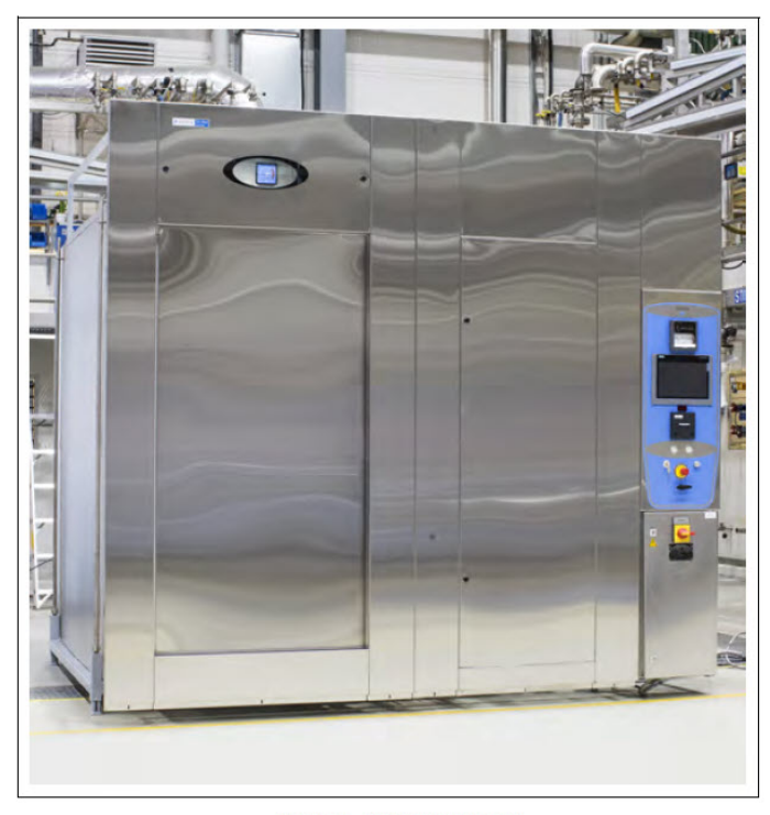
(Typical - details may vary.)