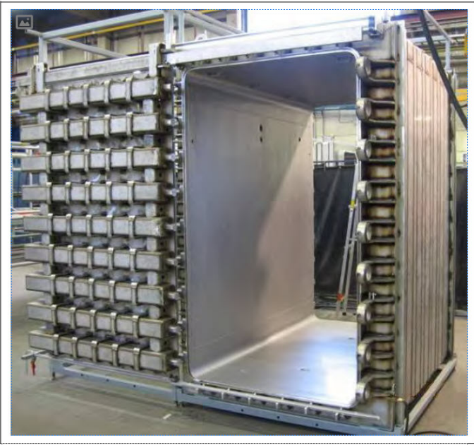
Full Jacket Chamber

Decontamination System . A fixed decontamination preconditioning phase is added to pre-conditioning menu selection. The pre-conditioning phase uses one vacuum pulse that is pulled through a dedicated heated stainless steel coil followed by an in-line 0.1 µm stainless steel stainer. Air exiting the chamber through the element is forced to contact the stainless steel coil and then pulled through the heated stainless steel strainer. The assembly can be set to heat up within a temperature range of 350° C [662 °F] as standard. The entire element is welded together and monitored for temperature at the beginning of the system and end to ensure consistent temperature and consistency of air flow. For more information please request a copy of THE VIRASURE TECHNICAL MONOGRAPH.