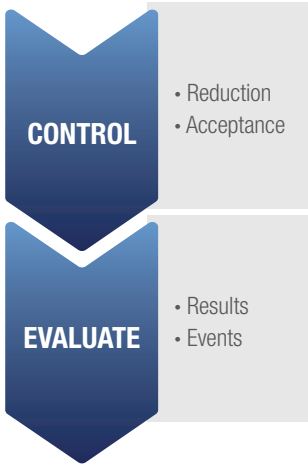
Figure 1. Elements of stainless-steel preservation control and evaluation.