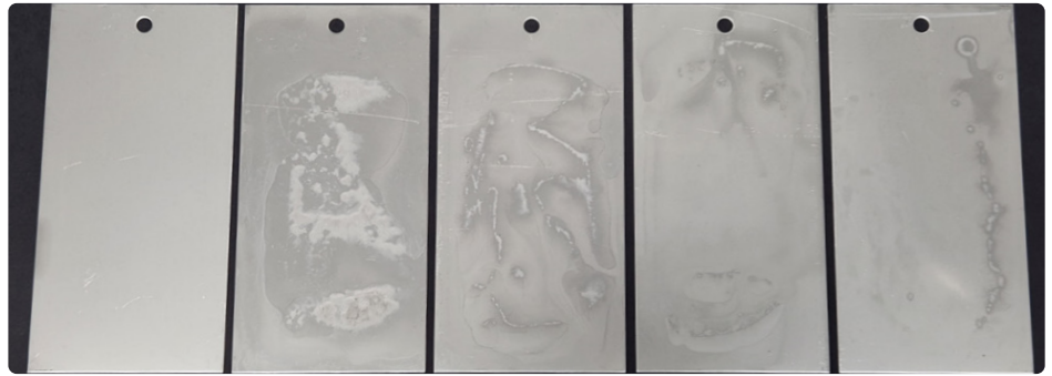
ProKlenz ALIGN Detergent Competitor A neutral detergent Competitor A alkaline detergent Competitor B neutral detergent Competitor B alkaline detergent