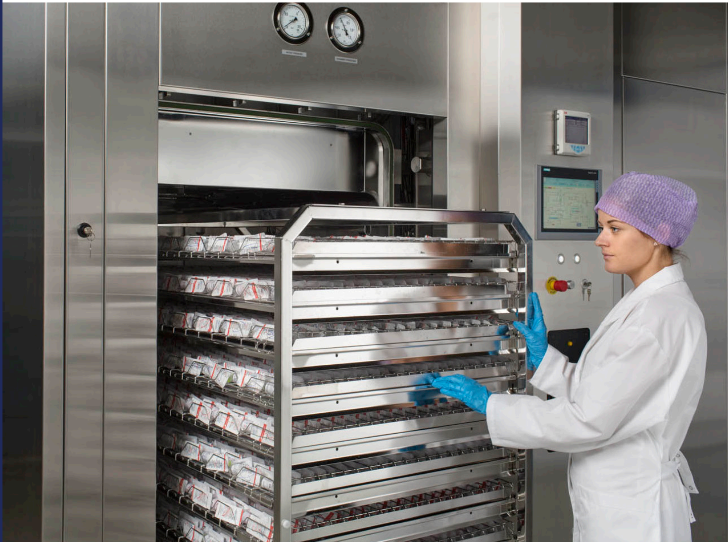
VHP™ LTS-V Low Temperature Sterilizer