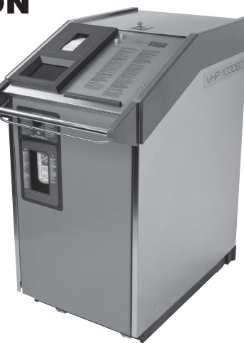
Figure 1. STERIS Corporation VHP 1000ED Generator.

Cleaning and biodecontamination of production aseptic processing rooms has traditionally been performed using chemical disinfectants such as sodium hypochlorite and commercial detergents. In general, liquid disinfectants are not a completely thorough process and recontamination of microbials such as yeasts and molds are a continuing problem. Gaseous processes such as formaldehyde and chlorine dioxide prove to be labor intensive and produce significant health and safety concerns. The application of Vaporized