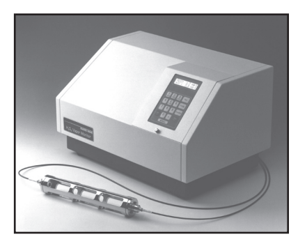
Figure 2. UOP Guided Hydrogen Peroxide Sensor

unit consists of four UV bulbs with 36 watt specification. Distances from the biological sample sites were measured and recorded. UV exposure time was for 8 hours.