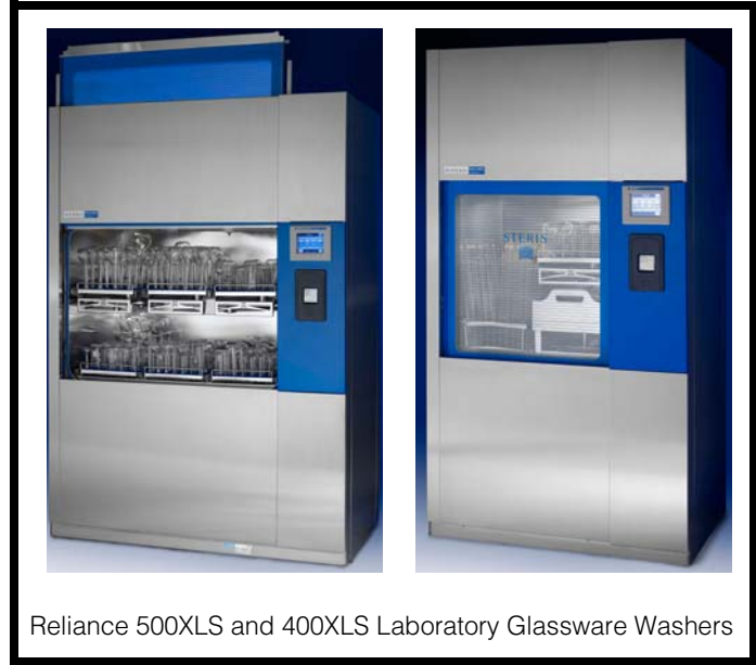
Reliance 500XLS and 400XLS Laboratory Glassware Washers

NOTE: When Effluent Heat Recovery option is selected, the drain valve and outlet are located outside of the washer. Refer to equipment drawings for more details.