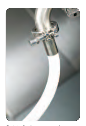
Quick, flexible connections to utilities and drain