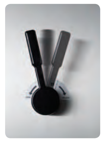
Our manual door lock mechanism on hinged-door models requires minimal effort