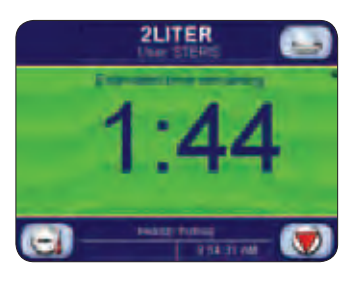
Large "time remaining" display is visible from across the room