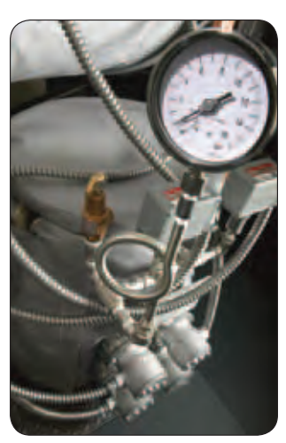
Powerful 72kW generator allows for fast, efficient processing - available in carbon or stainless steel