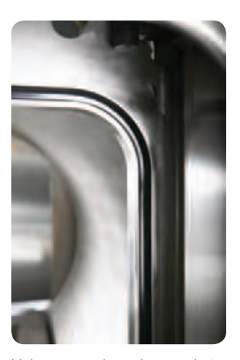
Unique one-piece door gasket requires no lubrication and is warranted for two years

Maximize response time and minimize unscheduled downtime on your equipment with secure, internet-based, 24 x 7 remote monitoring.