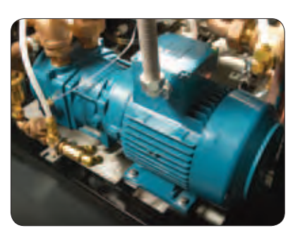
Two-stage vacuum pump reduces water consumption and provides quick, quiet, consistent chamber evacuation