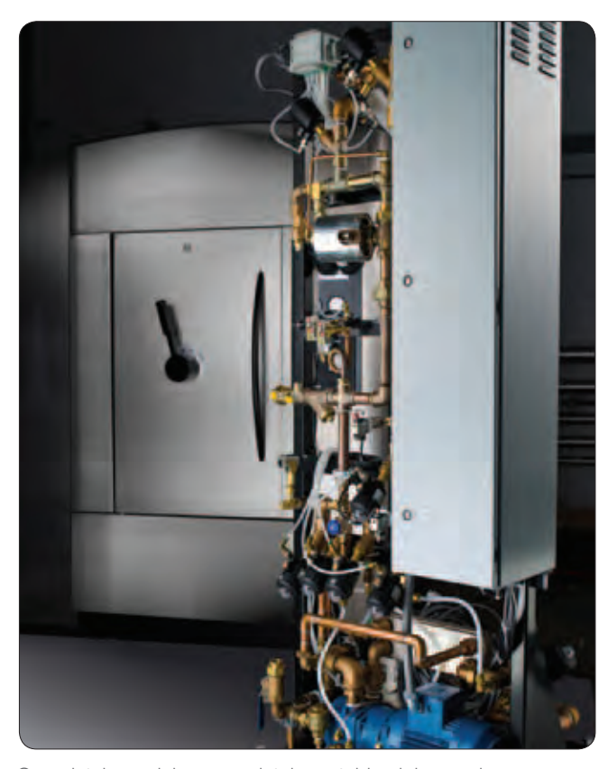
Completely modular, completely portable piping package