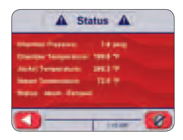
Bold color graphics clearly indicate cycle phase and status